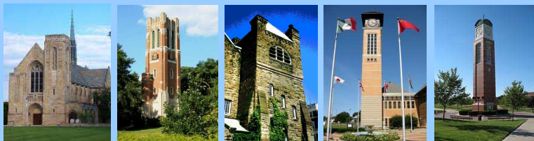
Burton Tower (UM), Lurie Tower (UM), St. Mary's of Redford, Jefferson Ave Presbyterian, Grosse Pointe Memorial, Christ Church Grosse Pointe, Beaumont Tower (MSU), Central Methodist Lansing, Beckering Carillon (GVSU), Cook Carillon (GVSU)